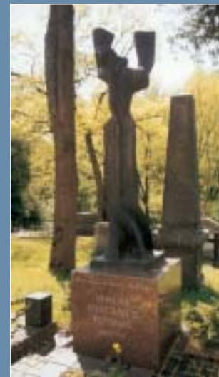
The new monuments of the end of the 20th century are in harmony with the old ones