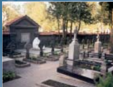
Graves of the Lithuanian soldiers-volunteers