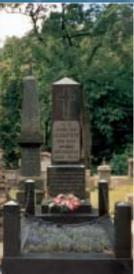
Most visited tombs of Dr. J. Basanavičius and M.K. Čiurlionis