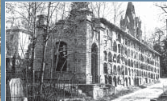
Fragment of the destroyed columbium

The cemetery is enrolled into the List of Immovable Cultural Properties of Lithuanian Republic. There are 164 architectural, historical or artistic monuments of Rasos cemetery in the List. The patriarch of Lithuania Jonas Basanavičius, famous