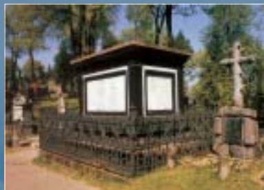
The sarcophagi shape tomb monument of W. Korwin-Milewska